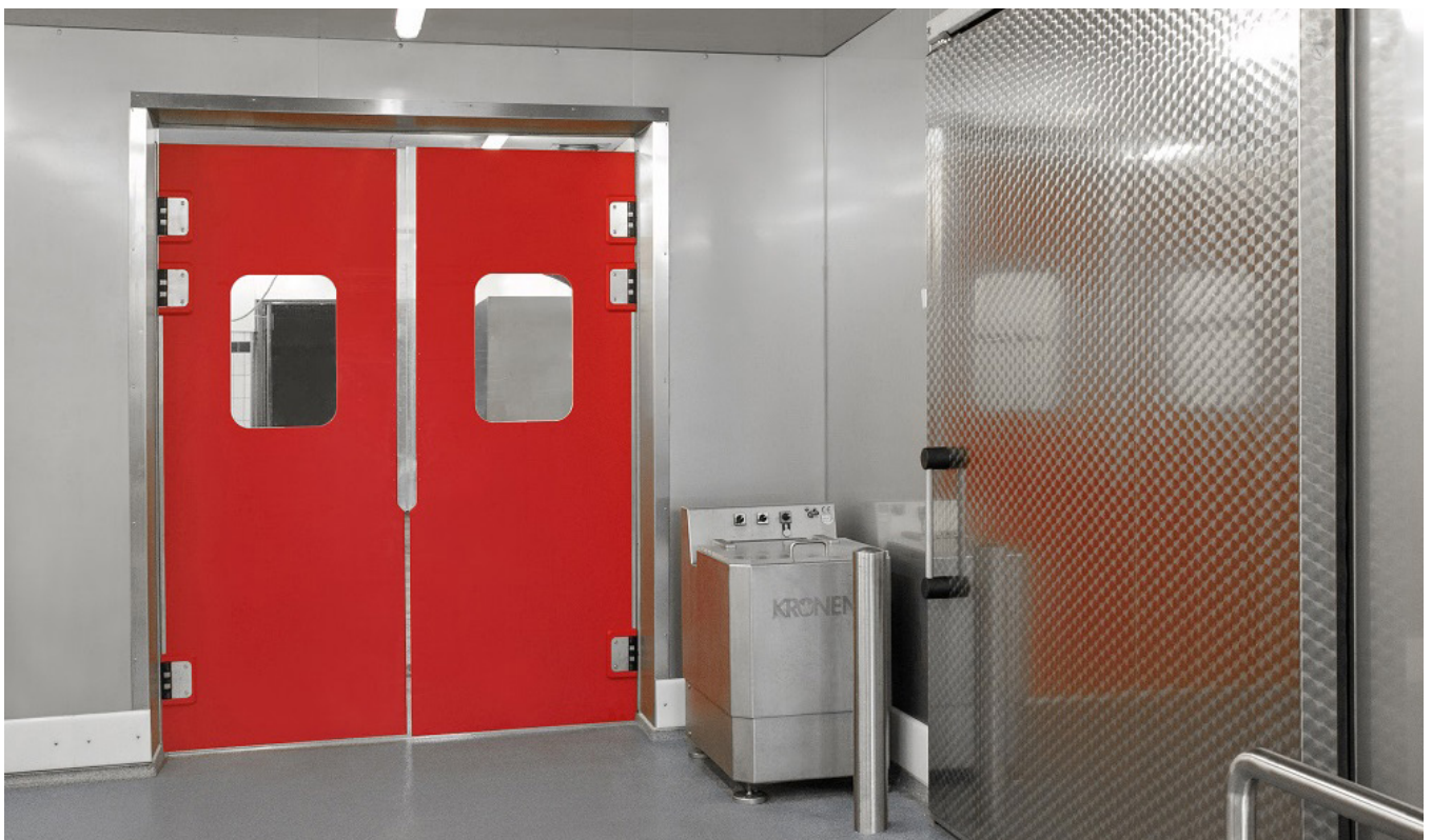
In cold storage with stainless steel flat frame riveting on existing frame