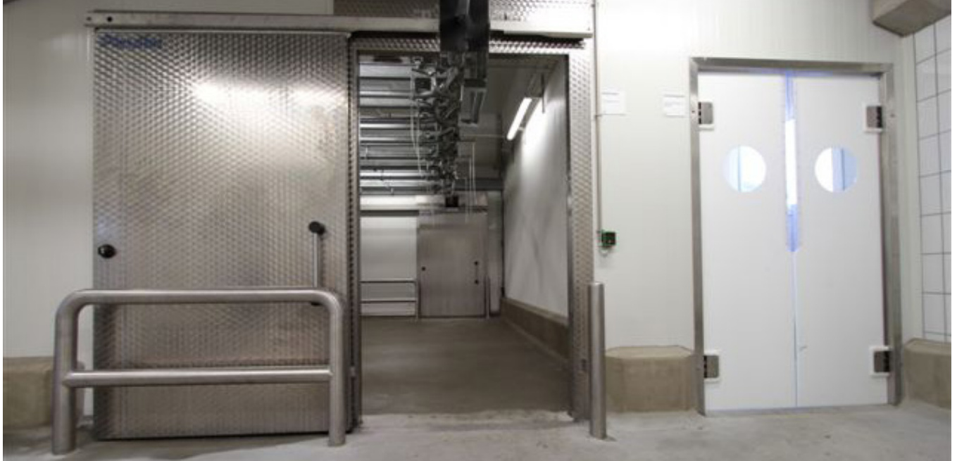
With stainless steel frame for insulating panels (customized)