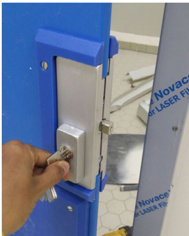
Stainless steel lock and PE lock protection