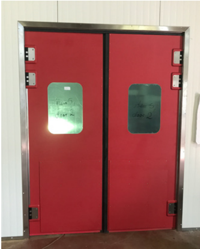
With full gasketing on top, bottom and in the middle