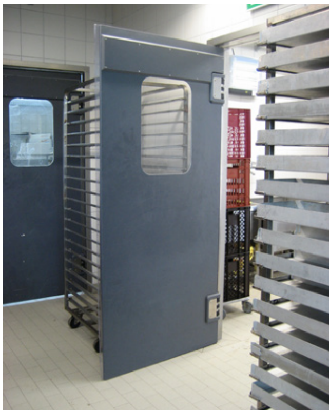
PE bumper above window and PVC finger protection