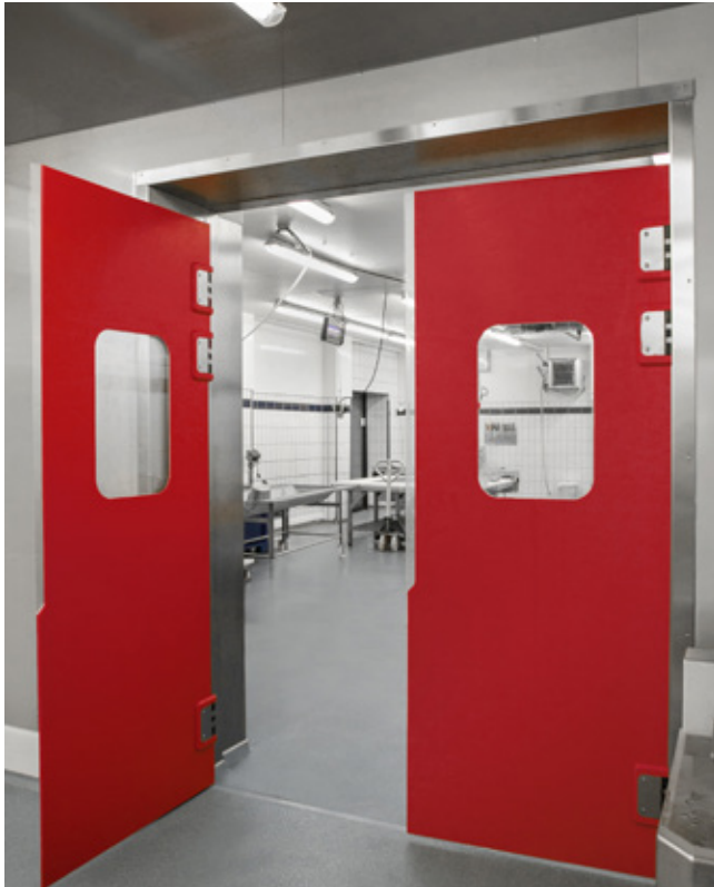
PVC finger protection starting from 900 mm