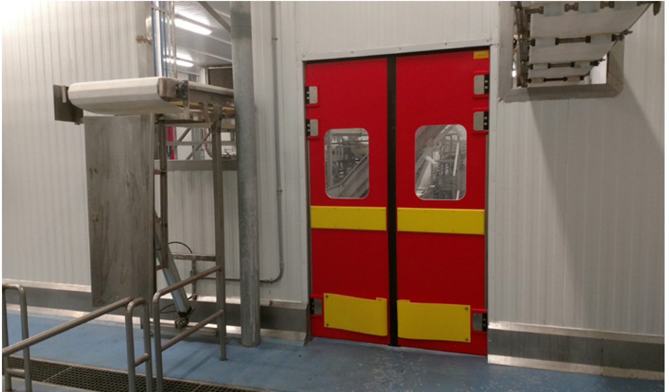
PE bumper, spring bumper and finger protection