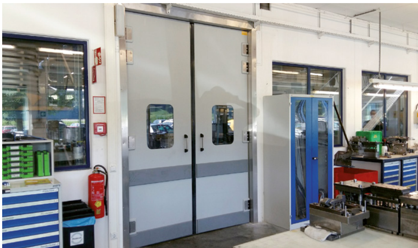
In workshop with stainless steel frame, handle, PE bumper and finger protection