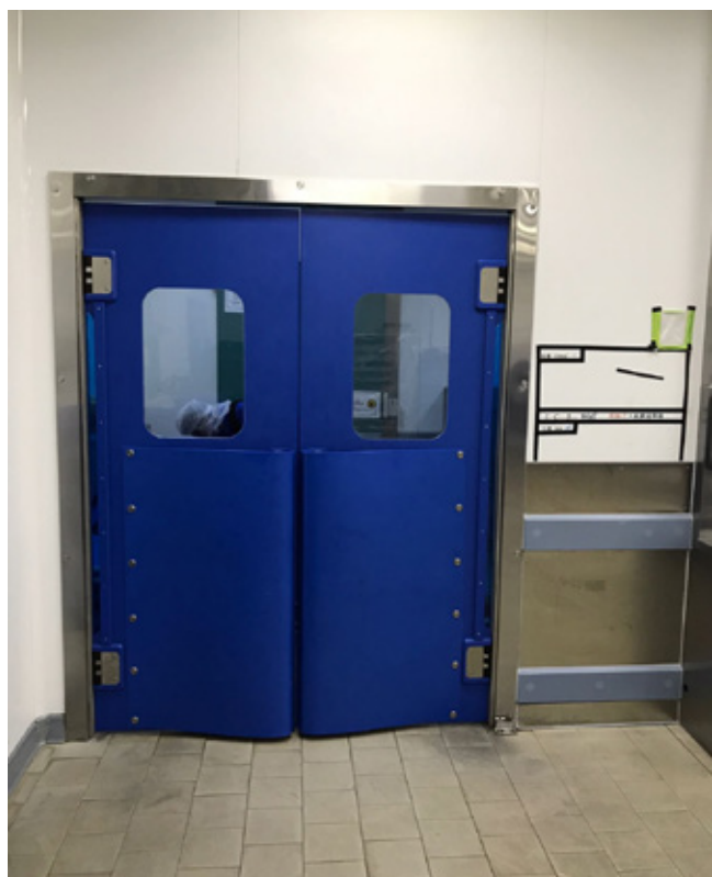
PE teardrop bumper 1200 mm high