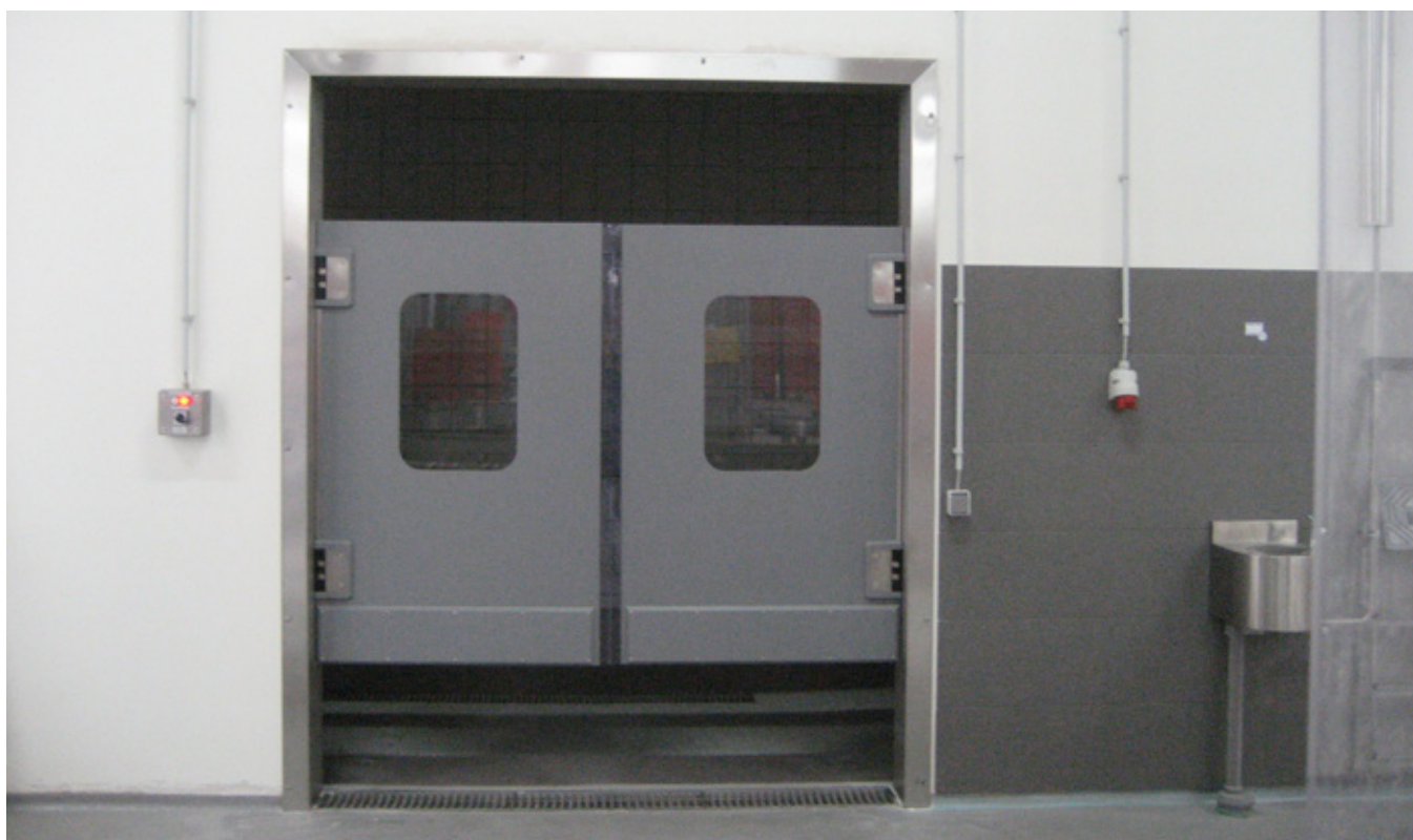
Between changing rooms and production area including stainless steel frame