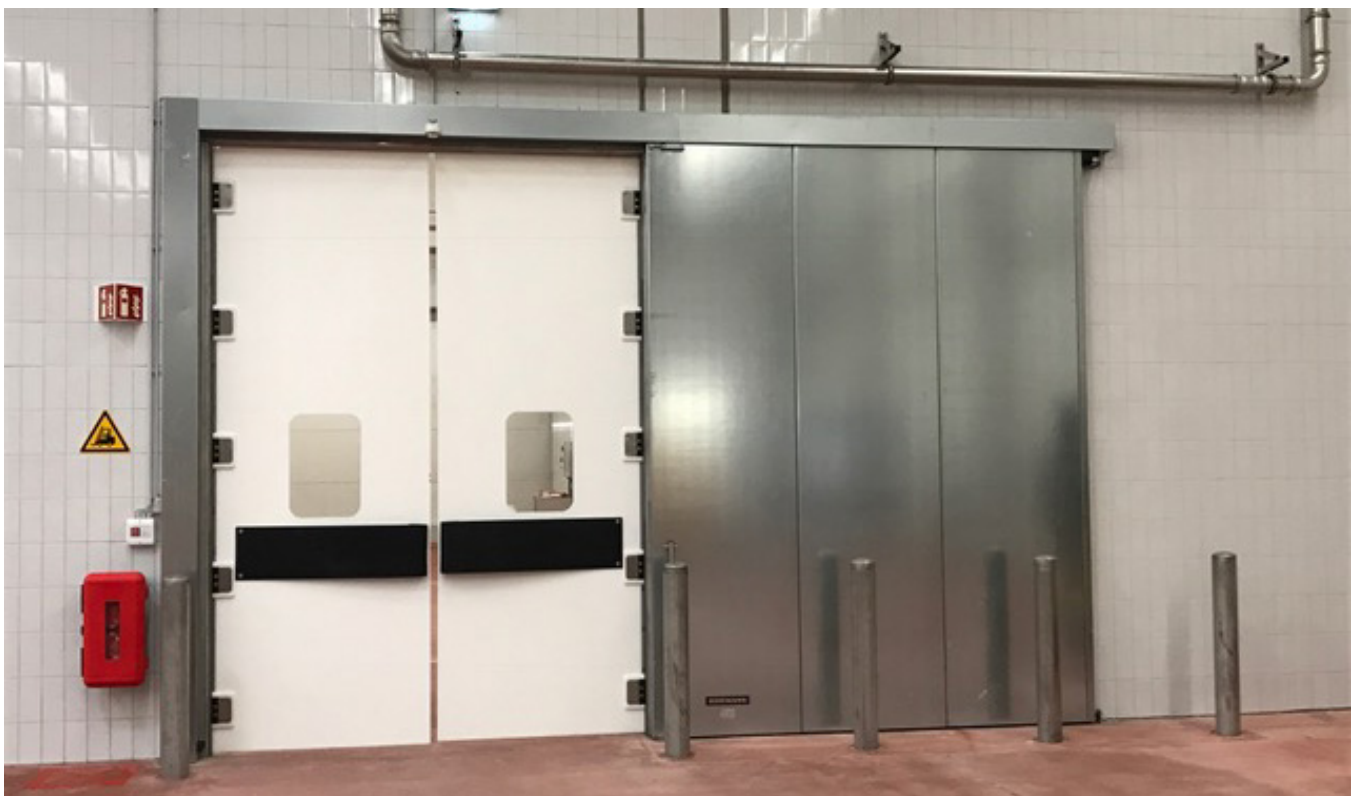
In combination with sliding door in cold storage facility