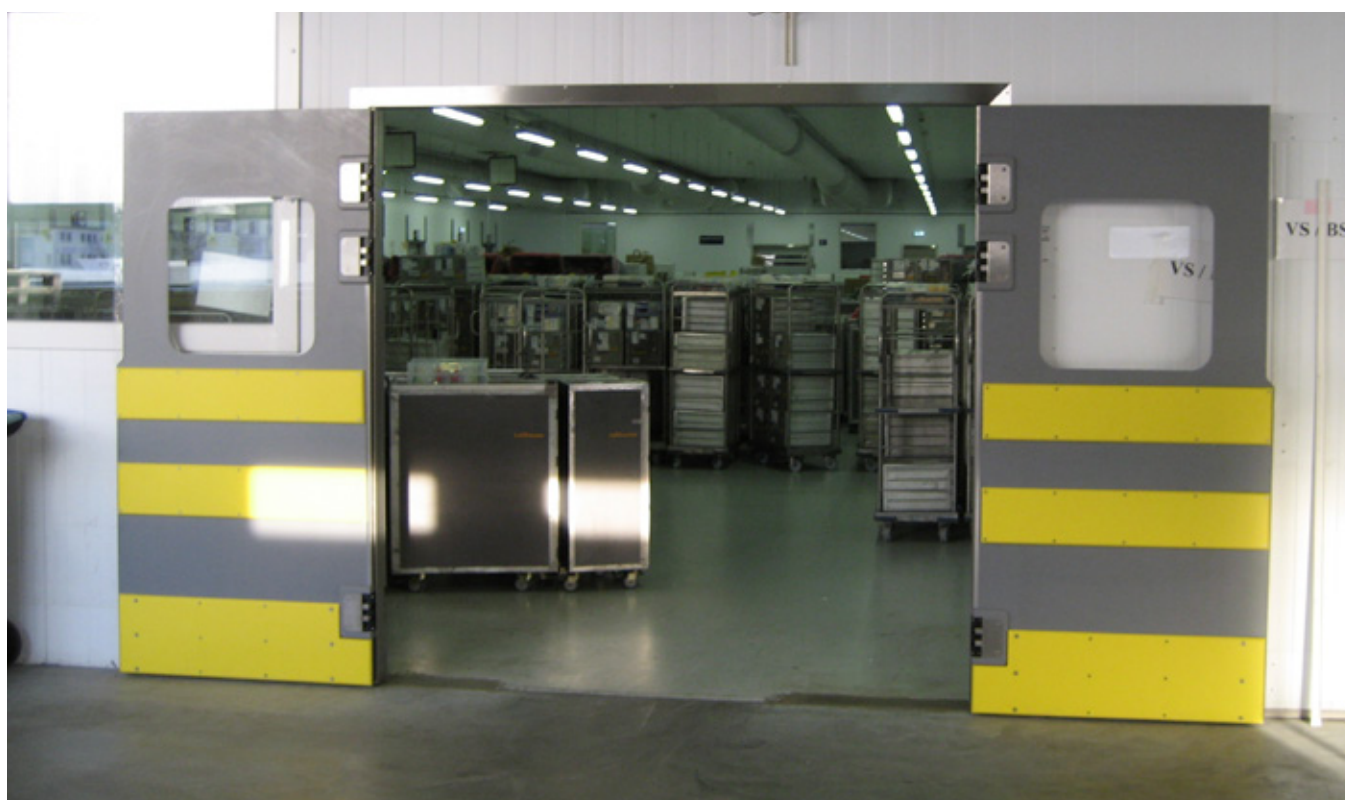
GP360 with 2 x 180° extra-large opening angle and 90° stop on request